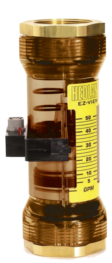
EZ-View with Radel<sup>®</sup> R body