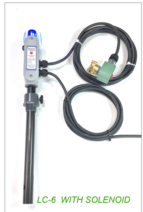
LC-6 WITH SOLENOID