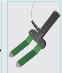
MO290-BP Moisture Baseboard Probe