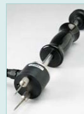
MO290-HP Moisture Hammer Probe