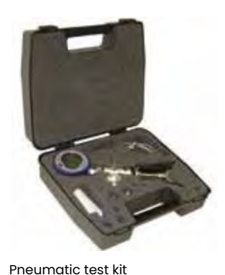
Low pressure pneumatic test kit