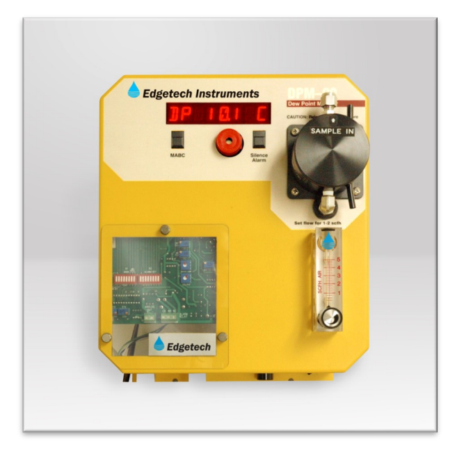
The DPM-99 for Medical Air

NFPA 99 is a standard issued by the National Fire Protection Agency. It is the code used to design compressed air systems for medical air in domestic hospitals and healthcare facilities. In these facilities there are two types of medical air systems, Level 1 and Level 2, defined by the standard as: