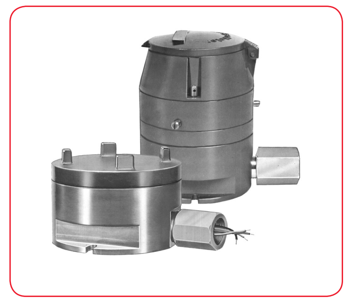
MS-E1 Pulse Transmitter (Front) MS-ER1 Transmitter / Register (Back)

Typical applications include liquid feeding, blending and batch control.