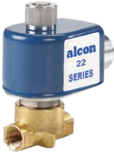
1/2" metal conduit hub shown in picture