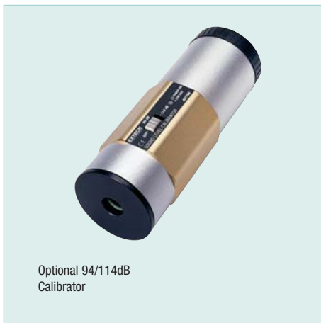
Optional 94/114dB Calibrator