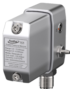
GP Pressure Module with Calibration Fixture

[1] A barometric pressure module is optional for ADT773/ADT783/ADT793. After inserting the barometric pressure module, the controller can be toggled to and from gauge and absolute pressure units.