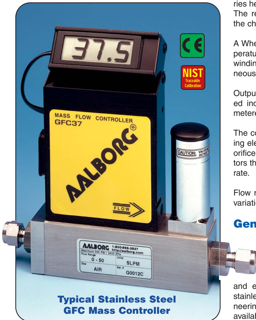
Typical Stainless Steel GFC Mass Controller

Metered gases are divided into two laminar flow paths, one through the primary flow conduit, and the other through a capillary sensor tube.